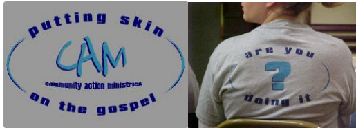
The "Old Style" Shirt

We want you to be involved in CAM in every way you can. You can order the shirts with the order form on Page Four!